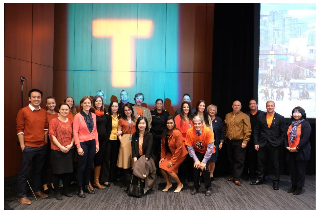
(Transit Police and TransLink enterprise recognize Orange Shirt Day at September 30, 2019 Town Hall event.)